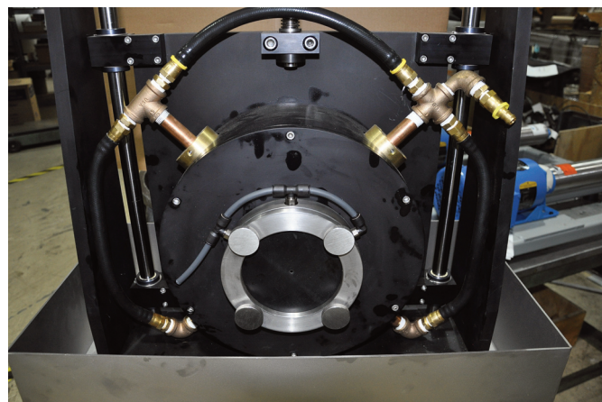
MAC Bar Wash spray head